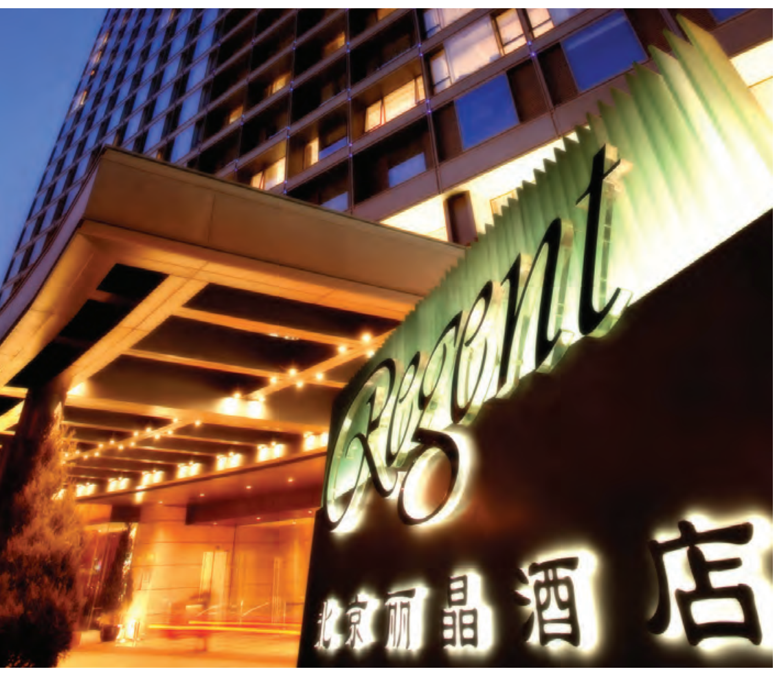
REGENT HOTEL, BEIJING. We represented our Taiwan-based, public-company client in the purchase of worldwide rights to the Regent Hotel brand, properties and hotel management agreements in Asia, Europe, the Middle East and the Caribbean. After the acquisition, we also assisted them with management agreements and condo hotel regime structure matters.

he Chinese Investment Group™ is a dedicated team of hotel and real estate lawyers in JMBM's Global Hospitality Group® that provides a gateway for Chinese investment in the United States. Using our unequaled global experience gained in hotel and real estate transactions, the Group provides Chinese investors with legal and business advice to make prudent and economically successful hotel and real estate investments in the United States.