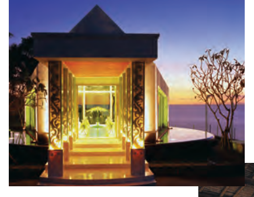
AYANA RESORT & SPA, BALI. As the Ritz-Carlton Bali, this fabulous resort arguably built the luxury chain's resort brand in Asia. Our team negotiated critical management agreement amendments that ultimately enabled the owner to terminate the long-term, no-cut contract. We developed the strategy and filed the litigation that successfully ousted the luxury brand operator. We then assisted the owner in selecting a new luxury operator and negotiating an agreement that was much more favorable to the owner.

The right outcome can unlock millions of dollars of value.