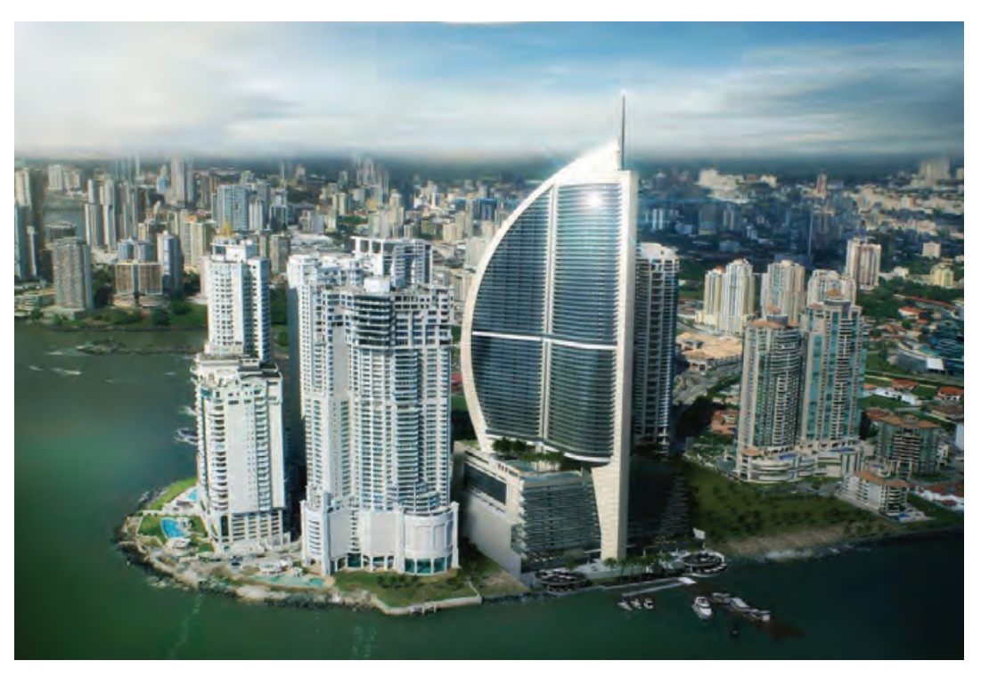
TRUMP OCEAN CLUB INTERNATIONAL HOTEL & TOWER, PANAMA CITY. Luxury hotels like this often provide the spark plug to energize and create value with high-end mixed-use for hotel-anchored residential, condo hotel, retail and office projects. We have represented the Trump Organization and other clients on more than 100 hotel mixed-use projects throughout the U.S., Latin America, the Caribbean, Asia and Europe.

rban mixed-use can be the most challenging and rewarding of all development projects. Studies have shown that the right hospitality elements combined with the right mix of retail, office, residential, hotel, fractional, spa, and entertainment components can enhance the value of the other elements in a mixed-use project by 34% or more and allow more attractive financing. By adding a hotel or other hospitality elements to an urban environment, a dynamic and sophisticated set of opportunities and challenges comes into play.