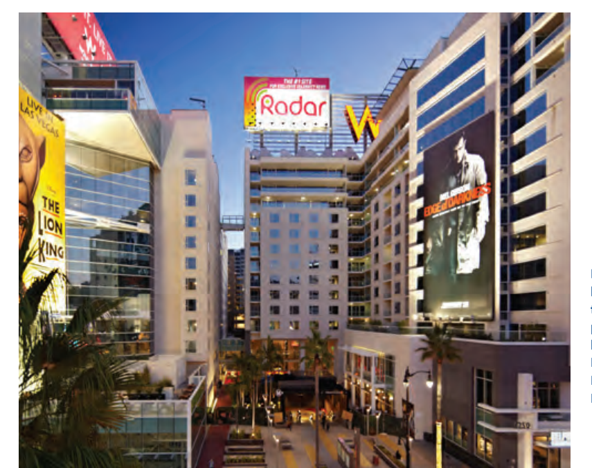
W HOTEL, HOLLYWOOD. We worked on many aspects of this mixed-use hotel property, including land use, almost $300 million of senior debt and mezzanine financing for development, and EB-5 financing for the Drai's Vegas-style night club and the Delphine fine-dining restaurant at the hotel.