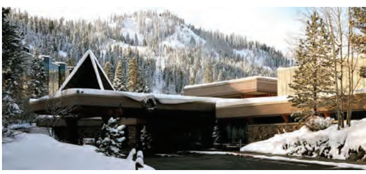
RESORT AT SQUAW CREEK, SQUAW VALLEY. We help owners of single hotels, portfolios and national chains develop a proactive approach to accessibility compliance and challenges, as we did for the owner of this prestigious ski resort.

Being ADA-friendly is good business. Accessibility compliance is the law. And it is much cheaper to be proactive on accessibility issues than to defend lawsuits.