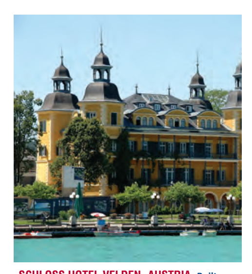
SCHLOSS HOTEL VELDEN, AUSTRIA. Built circa 1590, Schloss Hotel Velden has long been a preferred destination of the international jet set, royalty, dignitaries, movie stars and writers. We assisted the European lender in terminating a long-term hotel management agreement with a luxury brand operator without cost or payment to the operator.

Over the years, JMBM has been through all the business cycles — several times. Clients trust us with their most complex high-profile projects.