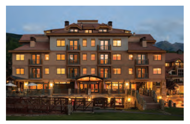
FAIRMONT SONOMA MISSION INN, SONOMA. We have assisted many lenders and special servicers with troubled assets — more than 1,000 workouts, bankruptcies, receiverships and recapitalizations. Representative clients include Wells Fargo Bank, JP Morgan Chase Bank, Union Bank, HSH Nordbank AG, HSBC Bank USA, and Lehman Brothers, Inc. Special servicer clients include Midland Loan Services (represented on this Fairmont Sonoma Mission Inn), Berkadia Commercial Mortgage, Helios AMC and ORIX Capital Markets.

Clients look to us as strategic advisors to assist in answering these questions and more. We develop and execute the "critical game plan." We understand how to identify and work with the strengths and vulnerabilities of each player in the capital stack — whether that means maximizing a creditor's recovery, protecting the owner's assets, reorganizing a viable business or providing asset acquisition and recapitalization strategies for opportunistic buyers.