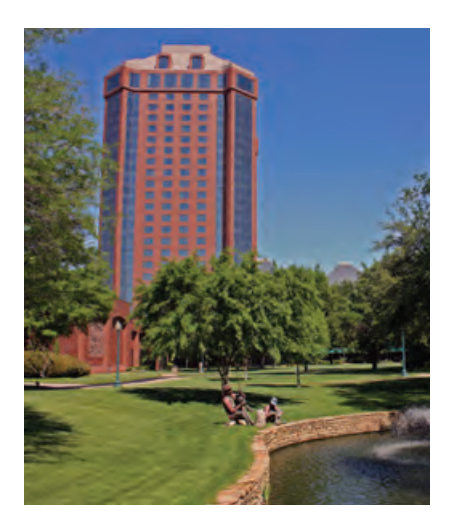
HILTON ANATOLE, DALLAS. The Crow Family hired our team to assist them in repositioning their landmark Anatole hotel. We helped them terminate a long-term, branded management agreement. Then we conducted an RFP for a new branded manager (using JMBM's HMA PRO™) and finalized a deal with Hilton Hotels.

Clients find a lot of advantages in working with JMBM's Global Hospitality Group®. Here are 5 things that set us apart from everyone else: