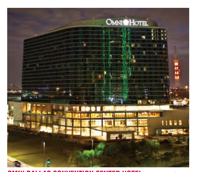
OMNI DALLAS CONVENTION CENTER HOTEL. The City of Dallas hired us to conduct a request for proposal (using JMBM's HMA PRO™ approach) for hotel brands to manage this large, convention center hotel. We assisted in the selection process and then negotiated a "qualified hotel management agreement" meeting the requirements of the Internal Revenue Code for a project financed with tax-exempt bonds.

Although most hotel management agreements are "one-off" deals, we have handled a number of portfolio transactions. The photos here are representative of the 27-hotel portfolio owned by Lodgian and its private equity fund owner. We helped them select 6 operators and complete hotel management agreements for all 27 franchised hotels in 17 states using JMBM's HMA PRO™ process.