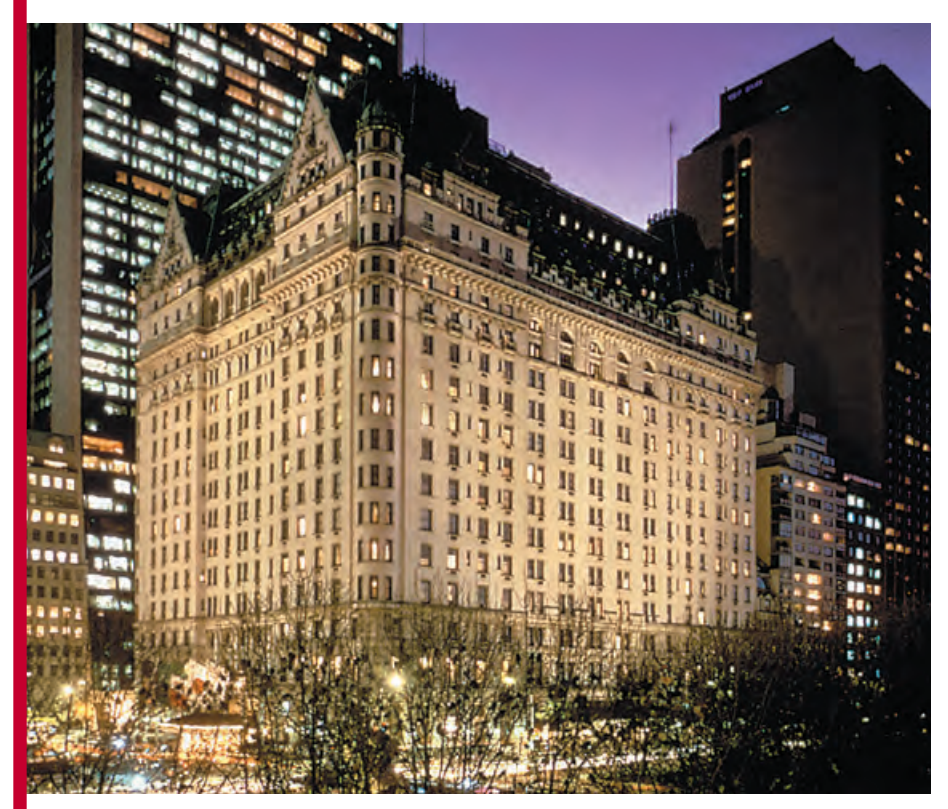
THE PLAZA, NEW YORK CITY. We have performed hotel management agreement work on some of the most iconic hotels in the world, such as The Plaza, Hilton Anatole, Hilton San Francisco, Omni Dallas Convention Center, InterContinental Jakarta, Regent Hong Kong, Trump Panama and the Schloss Velden Austria.

Our business and legal experience from more than 1,100 hotel management agreements provides the largest virtual database of hotel management and franchise agreement terms in the world.