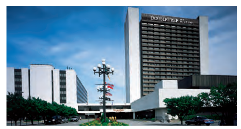
DOUBLETREE , BLOOMINGTON . We frequently put people and deals together. For example, this property was just one in a series of hotels bought by Platinum Equity after we introduced them to an independent hotel operator who sourced the first few deals. We handled the purchase, financing, management and franchise agreements for the hotels.

We have been there before. We can help you avoid pitfalls and seize opportunities.