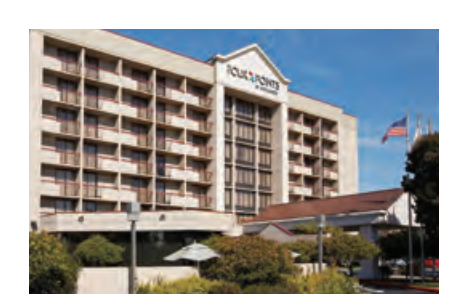
FOUR POINTS SHERATON, EMERYVILLE.