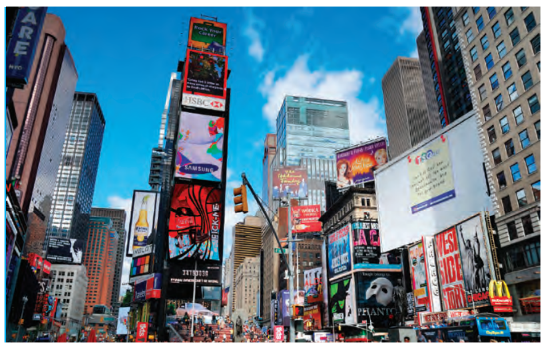
TIMES SQUARE, NEW YORK CITY. We have defended more than 750 ADA and related accessibility claims for owners of hotels, restaurants, spas, wineries, performing arts theaters, and other commercial real estate. In this case, our international hotel owner-operator client hired us for national representation in ADA and accessibility matters, including the defense of the high profile Department of Justice ADA compliance "sweep" of more than 50 hotels in Manhattan's Times Square entertainment district.