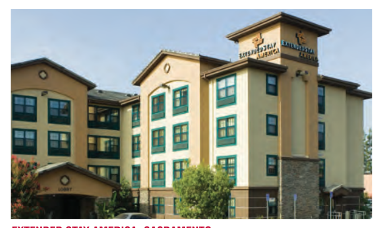
EXTENDED STAY AMERICA, SACRAMENTO. We have performed systemwide accessibility audits for Extended Stay America hotels (including prototype plan checking), and have assisted them nationally with proactive and defensive ADA and related accessibility compliance matters.