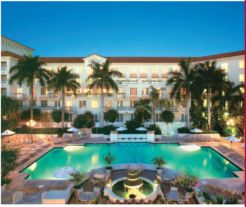
TURNBERRY ISLE RESORT, AVENTURA. JMBM's Global Hospitality Group® represented the owner of this iconic resort — in designing and executing a successful strategy to terminate a top luxury brand's management contract and remove the branded operator from the property. The contract had 50 years left to run. The victory included winning a Federal Court decision upholding our interpretation of applicable legal principles superseding the contract terms. The operator's suit to regain control of the hotel was soundly defeated on all grounds.

t is always best to start out with the right brand and operator for your hotel ... and an agreement with fair terms you can live with. But when you don't have that advantage and the situation becomes unbearable, what can you do as an owner to renegotiate or terminate a long-term, "no-cut" management agreement?