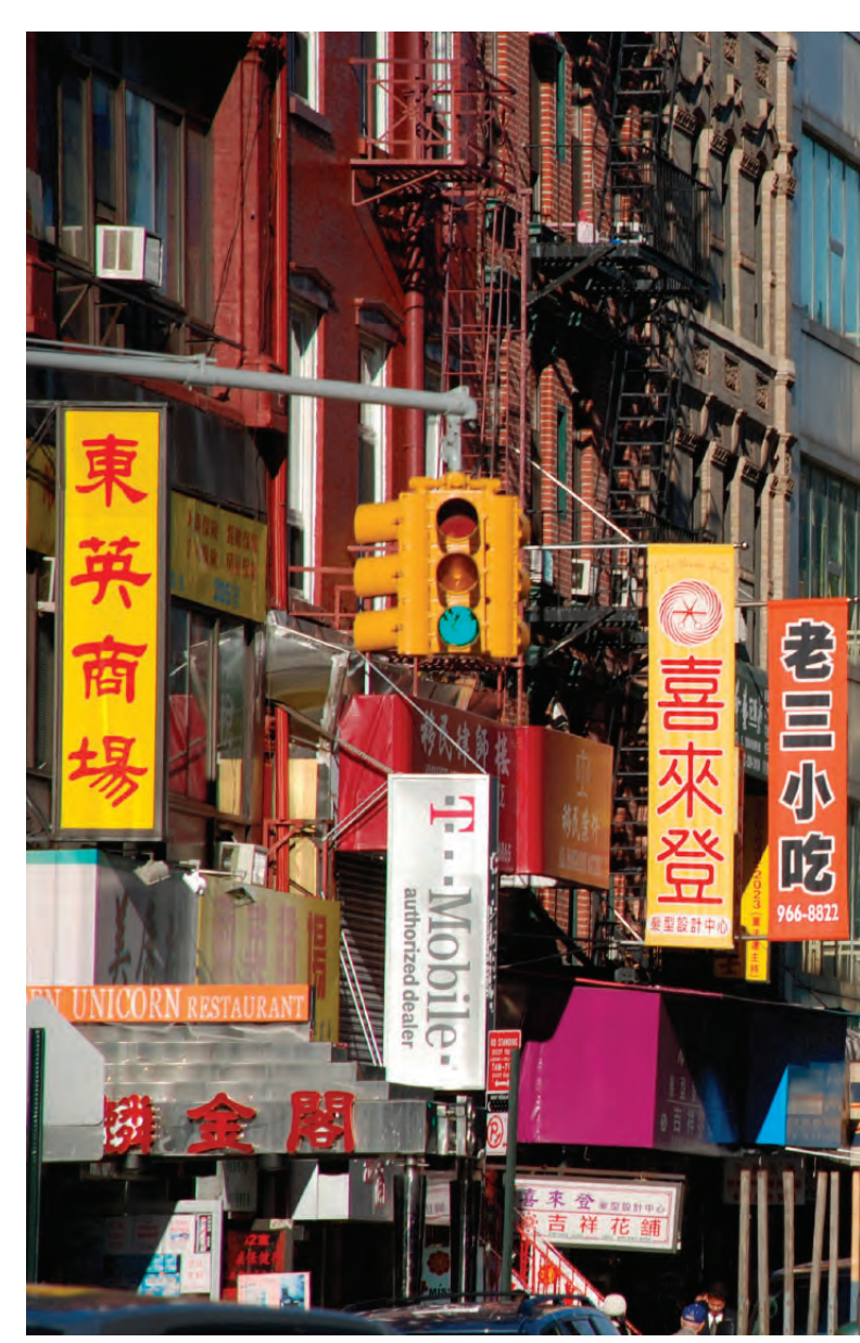
CHINATOWN, NEW YORK CITY. JMBM represented a wealthy Chinese family in multi-state federal court litigation against the New York hotel union, charging unlawful unionization of one of its hotels in Manhattan. The outcome stopped union organizing at all of the family's 8 New York City hotels.

Labor is one of a hotel's largest potentially controllable costs.