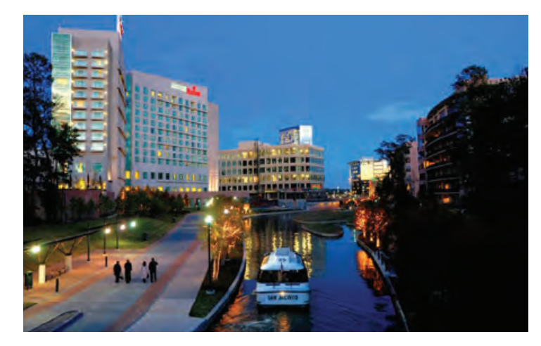
THE WOODLANDS, TEXAS. The Woodlands project, one of the largest hotel mixed-use developments in the United States, demonstrates how each component of a hotel mixed-use project enhances the other. Residential elements fetch higher prices and rents, retail and restaurants generate more sales, and hotels achieve significantly higher revenue per available room (RevPAR).

We can also help you assemble your hospitality development team with experienced and successful team members to optimize everything from entitlements, architecture, construction and banking to management, marketing, financing and more — from conception through opening and then into ongoing operations.