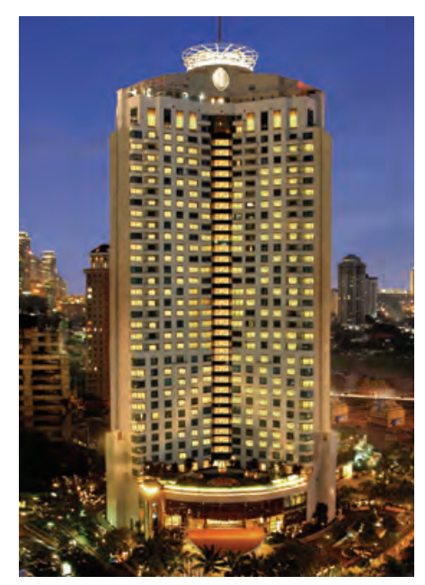
INTERCONTINENTAL, JAKARTA. JMBM assisted the owner of this landmark Jakarta hotel in terminating a long-term, no-cut, management agreement with a top luxury brand, selecting a new operator and rebranding the hotel as the InterContinental Midplaza.

When they tell you that something is a "standard practice," we might tell you something different.