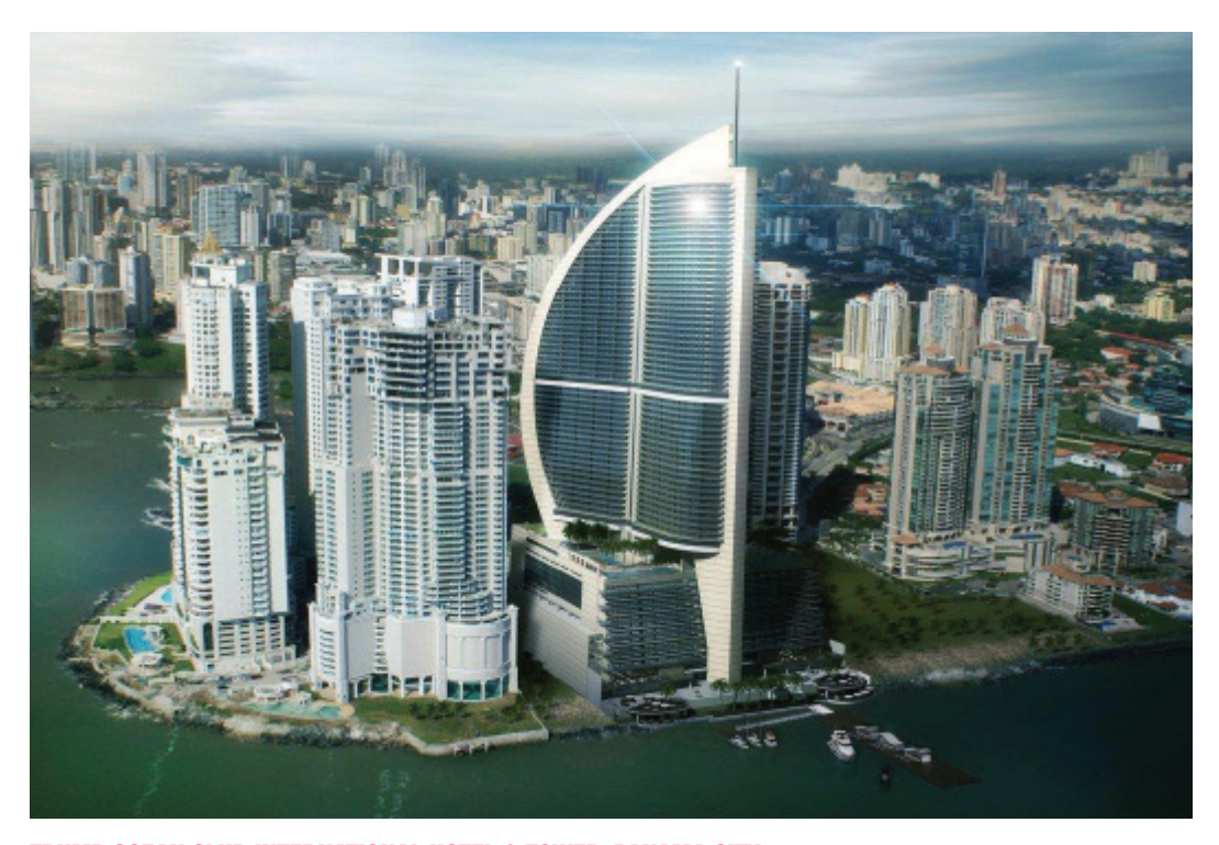
TRUMP OCEAN CLUB INTERNATIONAL HOTEL & TOWER, PANAMA CITY. Luxury hotels like this often provide the spark plug to energize and create value with high-end mixed-use for hotel-anchored residential, condo hotel, retail and office projects. We have represented the Trump Organization and other clients on more than 100 hotel mixed-use projects throughout the U.S., Latin America, the Caribbean, Asia and Europe.

rban mixed-use can be the most challenging and rewarding of all development projects. Studies have shown that the right hospitality elements combined with the right mix of retail, office, residential, hotel, fractional, spa, and entertainment components can enhance the value of the other elements in a mixed-use project by 34% or more and allow more attractive financing. By adding a hotel or other hospitality elements to an urban environment, a dynamic and sophisticated set of opportunities and challenges comes into play.