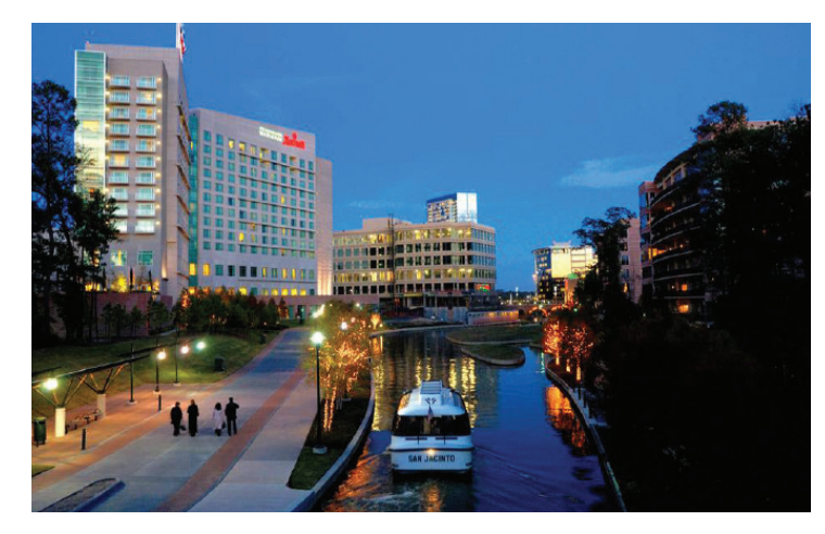
THE WOODLANDS, TEXAS. The Woodlands project, one of the largest hotel mixed-use developments in the United States, demonstrates how each component of a hotel mixed-use project enhances the other. Residential elements fetch higher prices and rents, retail and restaurants generate more sales, and hotels achieve significantly higher revenue per available room (RevPAR).

We can also help you assemble your hospitality development team with experienced and successful team members to optimize everything from entitlements, architecture, construction and banking to management, marketing, financing and more — from conception through opening and then into ongoing operations.