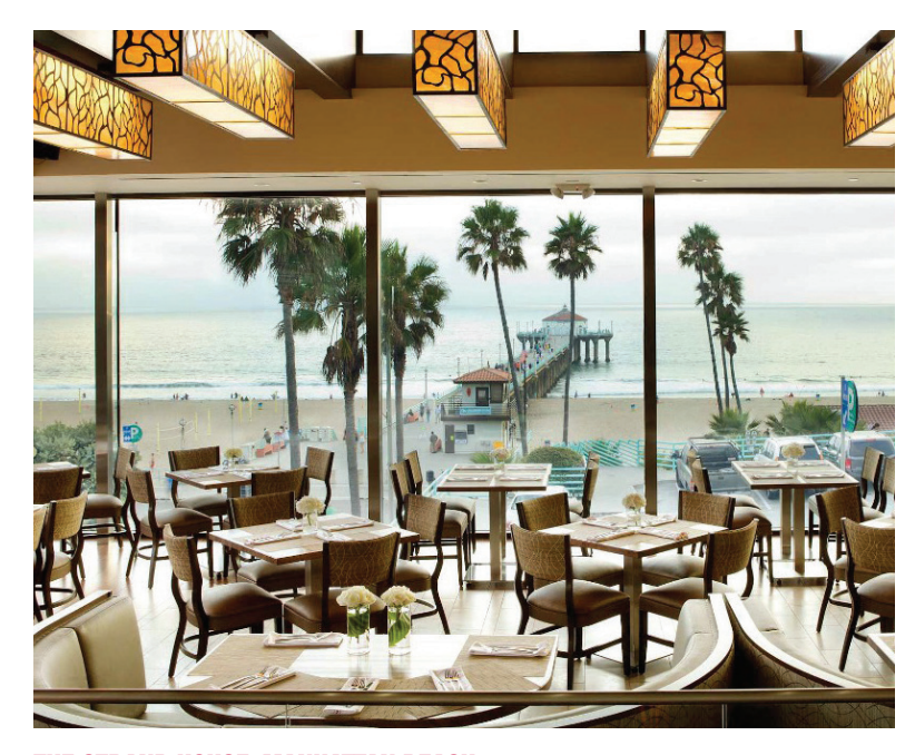
THE STRAND HOUSE, MANHATTAN BEACH. We provided a range of legal services for this restaurant, including acquisition and leasing, structuring a joint venture, procuring a liquor license and resolving land use issues relating to its unique beachfront setting.

Vacation ownership projects like this Hilton Grand Vacations Club are a vibrant addition to any mixed-use hospitality development. For this property, JMBM's hospitality lawyers advised on branding and management issues, and the integration of hotel and timeshare facilities. Consumer demand and satisfaction levels continue to set new highs for these kinds of projects. Development and sales are limited only by access to financing.