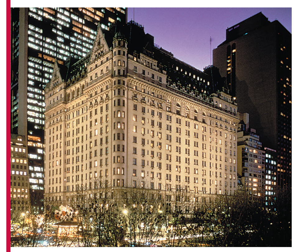
THE PLAZA, NEW YORK CITY. We have performed hotel management agreement work on some of the most iconic hotels in the world, such as The Plaza, Hilton Anatole, Hilton San Francisco, Omni Dallas Convention Center, InterContinental Jakarta, Regent Hong Kong, Trump Panama and the Schloss Velden Austria.

Our business and legal experience from more than 2,800 hotel management agreements provides the largest virtual database of hotel management and franchise agreement terms in the world.