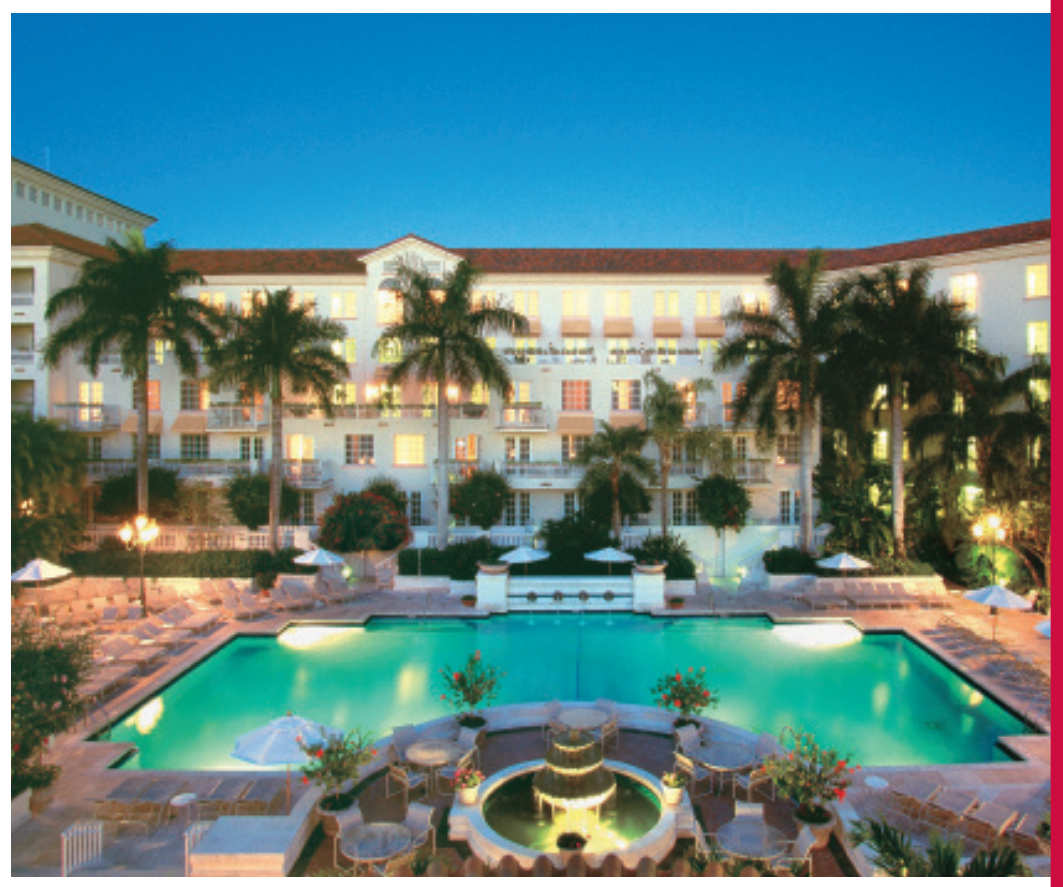
TURNBERRY ISLE RESORT, AVENTURA. JMBM's Global Hospitality Group® represented the owner of this iconic resort — in designing and executing a successful strategy to terminate a top luxury brand's management contract and remove the branded operator from the property. The contract had 50 years left to run. The victory included winning a Federal Court decision upholding our interpretation of applicable legal principles superseding the contract terms. The operator's suit to regain control of the hotel was soundly defeated on all grounds.

t is always best to start out with the right brand and operator for your hotel ... and an agreement with fair terms you can live with. But when you don't have that advantage and the situation becomes unbearable, what can you do as an owner to renegotiate or terminate a long-term, "no-cut" management agreement?