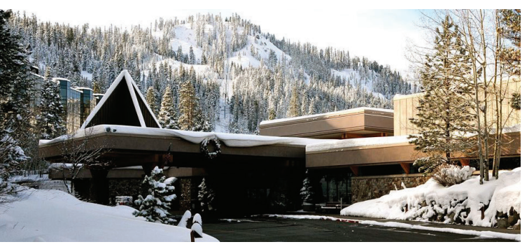
RESORT AT SQUAW CREEK, SQUAW VALLEY. We help owners of single hotels, portfolios and national chains develop a proactive approach to accessibility compliance and challenges, as we did for the owner of this prestigious ski resort.

Being ADA-friendly is good business. Accessibility compliance is the law. And it is much cheaper to be proactive on accessibility issues than to defend lawsuits.