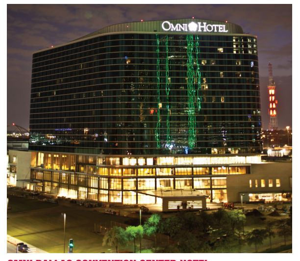
OMNI DALLAS CONVENTION CENTER HOTEL. The City of Dallas hired us to conduct a request for proposal (using JMBM's HMA PRO™ approach) for hotel brands to manage this large, convention center hotel. We assisted in the selection process and then negotiated a "qualified hotel management agreement" meeting the requirements of the Internal Revenue Code for a project financed with tax-exempt bonds.

And of course, there are many luxury properties and world-class resorts we have worked on too, like the Ritz-Carlton Bali, Four Seasons Maui, Las Ventanas, The Boulders, and Turnberry Resort & Spa.