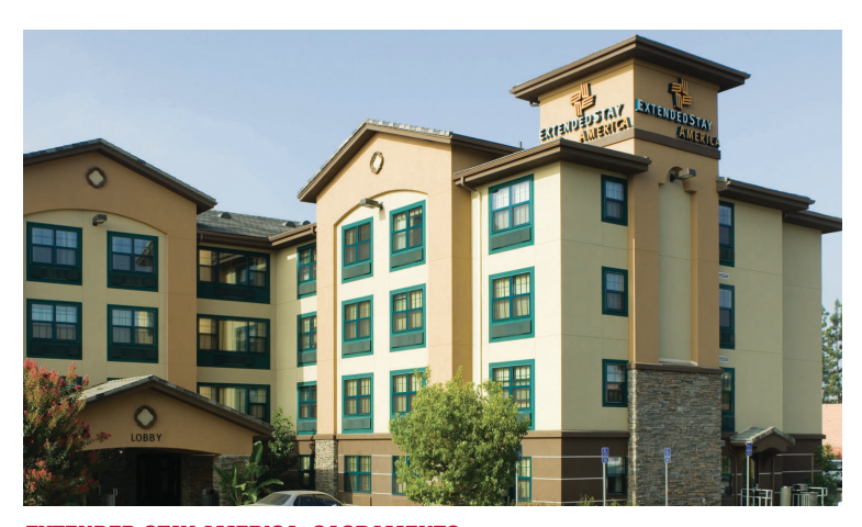
EXTENDED STAY AMERICA, SACRAMENTO. We have performed system-wide accessibility audits for Extended Stay America hotels (including prototype plan checking), and have assisted them nationally with proactive and defensive ADA and related accessibility compliance matters.