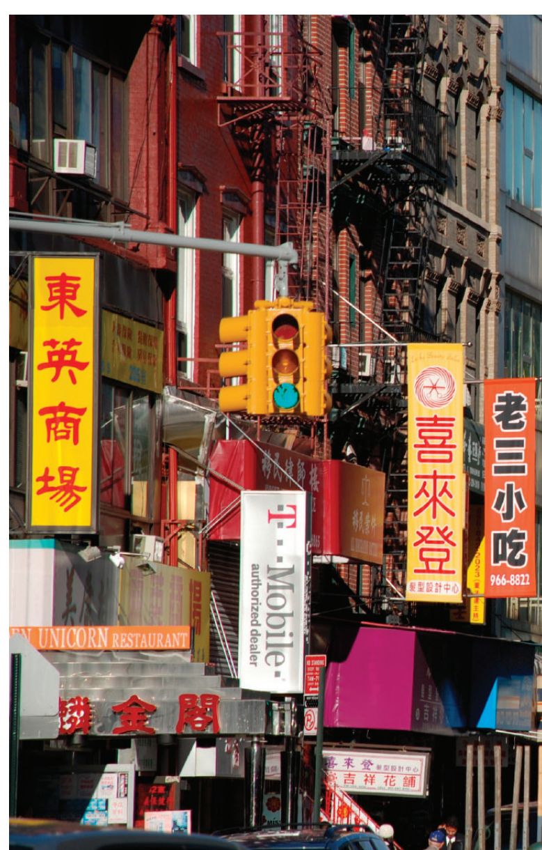
CHINATOWN, NEW YORK CITY. JMBM represented a wealthy Chinese family in multi-state federal court litigation against the New York hotel union, charging unlawful unionization of one of its hotels in Manhattan. The outcome stopped union organizing at all of the family's 8 New York City hotels.

Labor is one of a hotel's largest potentially controllable costs.