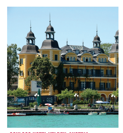
SCHLOSS HOTEL VELDEN, AUSTRIA. Built circa 1590, Schloss Hotel Velden has long been a preferred destination of the international jet set, royalty, dignitaries, movie stars and writers. We assisted the European lender in terminating a long-term hotel management agreement with a luxury brand operator without cost or payment to the operator.

Over the years, JMBM has been through all the business cycles — several times. Clients trust us with their most complex high-profile projects.