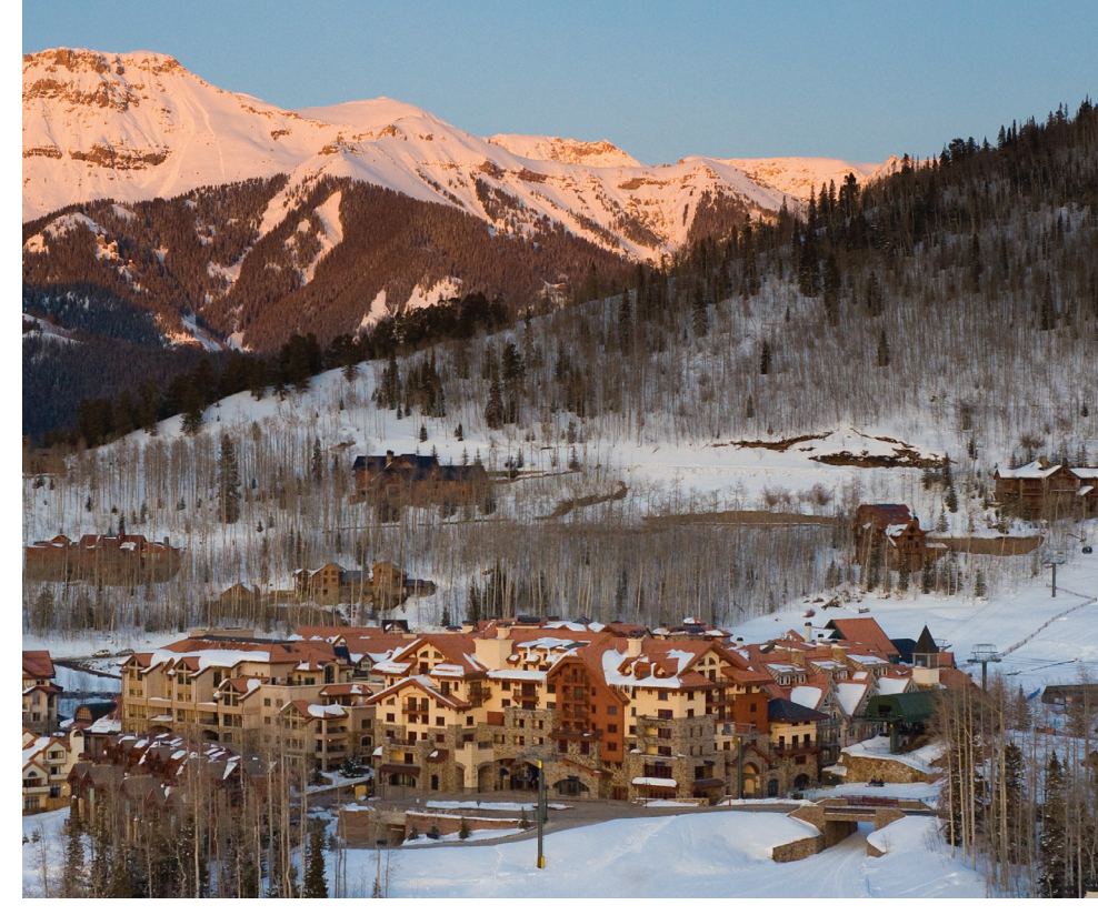
HOTEL MADELINE, TELLURIDE. Our hotel lawyers represented a European bank in maximizing recovery on a $156 million loan secured by a luxury hotel mixed-use property (with residential and retail) operated by a top luxury brand. Our strategies resulted in the lender taking possession of the hotel and other mixed-use assets, while avoiding liability under an SNDA and terminating the long-term hotel management agreement. Termination of the management agreement immediately added at least $41 million of value to the property.