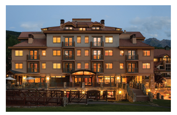
FAIRMONT SONOMA MISSION INN, SONOMA. We have assisted many lenders and special servicers with troubled assets — more than 1,000 workouts, bankruptcies, receiverships and recapitalizations. Representative clients include Wells Fargo Bank, JP Morgan Chase Bank, Union Bank, HSH Nordbank AG, HSBC Bank USA, and Lehman Brothers, Inc. Special servicer clients include Midland Loan Services (represented on this Fairmont Sonoma Mission Inn), Berkadia Commercial Mortgage, Helios AMC and ORIX Capital Markets.

Clients look to us as strategic advisors to assist in answering these questions and more. We develop and execute the "critical game plan." We understand how to identify and work with the strengths and vulnerabilities of each player in the capital stack — whether that means maximizing a creditor's recovery, protecting the owner's assets, reorganizing a viable business or providing asset acquisition and recapitalization strategies for opportunistic buyers.