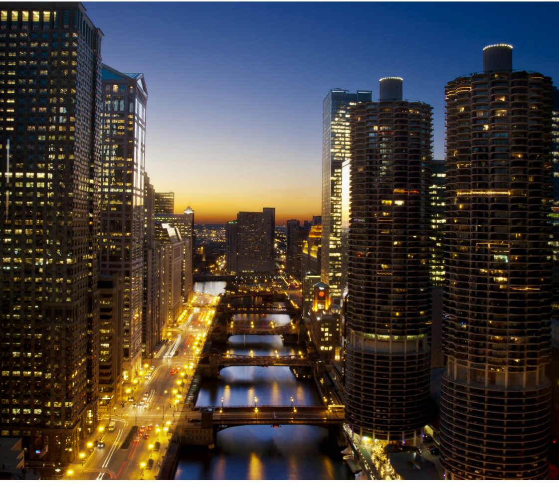
The key is finding the right player for each role. The project can be anywhere, as long as you get the right team members to guide and execute the process.