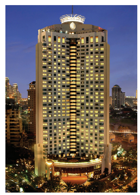
INTERCONTINENTAL, JAKARTA. JMBM assisted the owner of this landmark Jakarta hotel in terminating a long-term, no-cut, management agreement with a top luxury brand, selecting a new operator and rebranding the hotel as the InterContinental Midplaza.

When they tell you that something is a "standard practice," we might tell you something different.