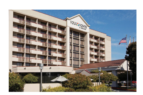
FOUR POINTS SHERATON, EMERYVILLE.