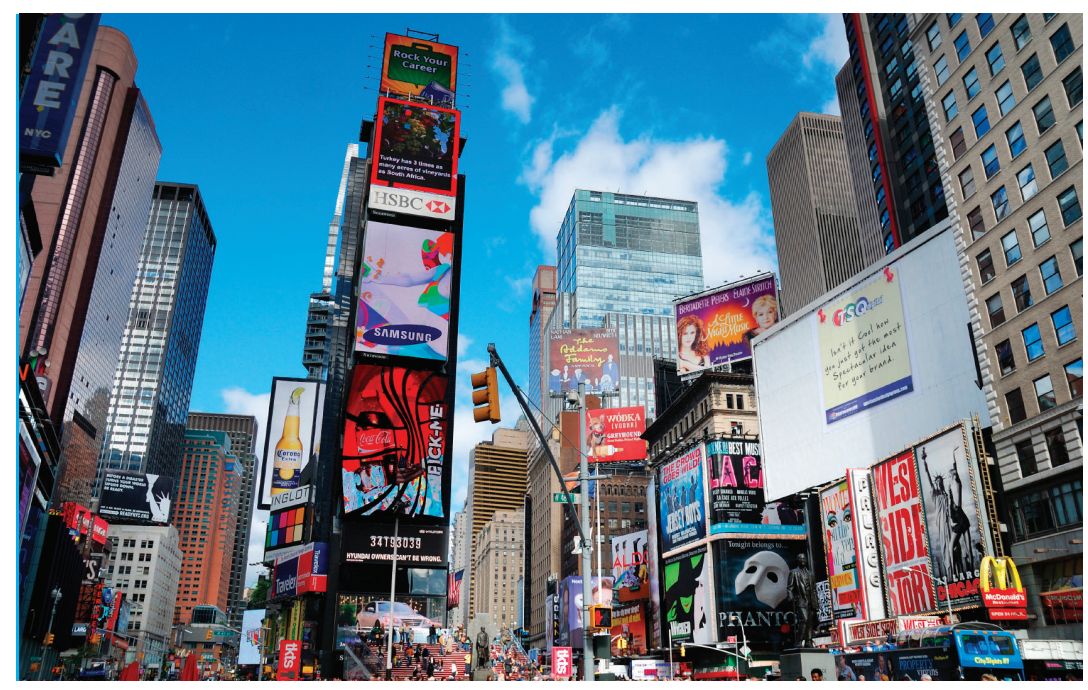
TIMES SQUARE, NEW YORK CITY. We have defended more than 750 ADA and related accessibility claims for owners of hotels, restaurants, spas, wineries, performing arts theaters, and other commercial real estate. In this case, our international hotel owner-operator client hired us for national representation in ADA and accessibility matters, including the defense of the high profile Department of Justice ADA compliance "sweep" of more than 50 hotels in Manhattan's Times Square entertainment district.