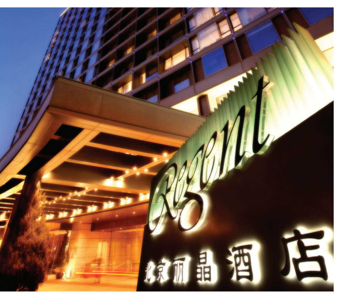
REGENT HOTEL, BEIJING. We represented our Taiwan-based, public-company client in the purchase of worldwide rights to the Regent Hotel brand, properties and hotel management agreements in Asia, Europe, the Middle East and the Caribbean. After the acquisition, we also assisted them with management agreements and condo hotel regime structure matters.

he Chinese Investment Group™ is a dedicated team of hotel and real estate lawyers in JMBM's Global Hospitality Group® that provides a gateway for Chinese investment in the United States. Using our unequaled global experience gained in hotel and real estate transactions, the Group provides Chinese investors with legal and business advice to make prudent and economically successful hotel and real estate investments in the United States.