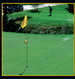
Golf & Country Clubs