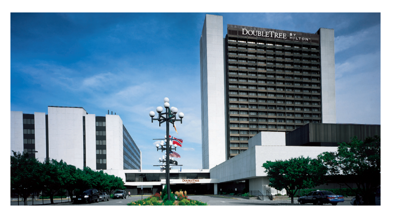
DOUBLETREE, BLOOMINGTON. We frequently put people and deals together. For example, this property was just one in a series of hotels bought by Platinum Equity after we introduced them to an independent hotel operator who sourced the first few deals. We handled the purchase, financing, management and franchise agreements for the hotels.

We have been there before. We can help you avoid pitfalls and seize opportunities.