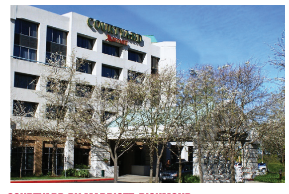
COURTYARD BY MARRIOTT, RICHMOND.

Because of our expertise and leadership in hospitality lending, we regularly represent lenders on their hotel loans. The properties shown here are representative of some of the smaller loans we have handled. We also handle financing for larger, more complex properties and resorts, domestically and internationally, and portfolios, including many hotels in the brand families of Hilton, Intercontinental, Marriott (including Starwood), Hyatt, Best Western and Choice. Some high-profile lending work includes the W Hollywood, Four Seasons Scottsdale, Four Seasons Aviara, Ritz-Carlton Highlands, Marriott Renaissance Las Vegas, and many more.